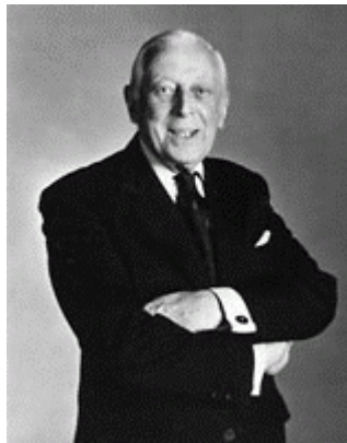
Alistair Cooke 1908-2004